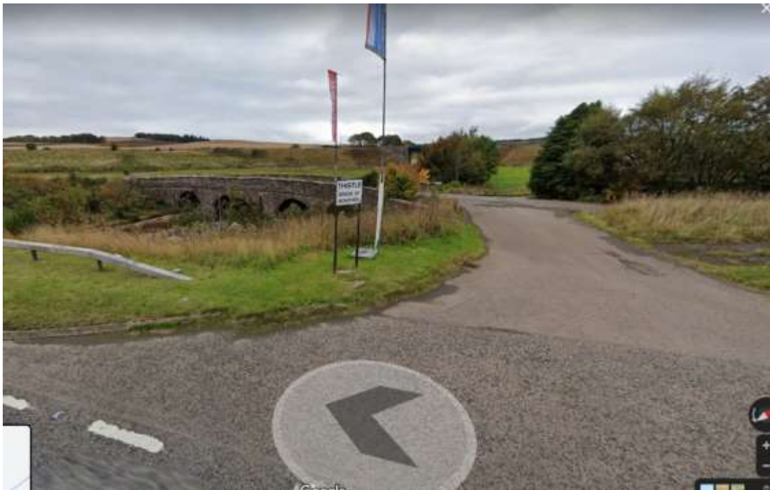
Parking available on old bridge